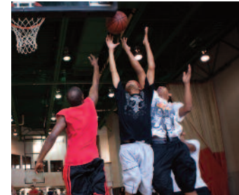
Featuring the 3 On 3 Basketball Tournament