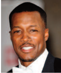
Bro. Flex Alexander Host

Wednesday July 19, 2017 6:30PM Renaissance Ballroom