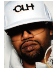
Juvenile In Concert

Friday July 21, 2017 8:00PM Renaissance Ballroom