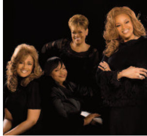
The Clark Sisters In Concert